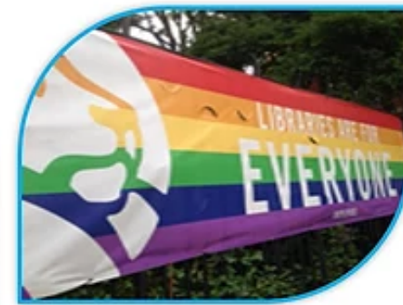
New York City Public Library, June 2019.